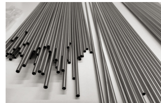
Thin wall tubing