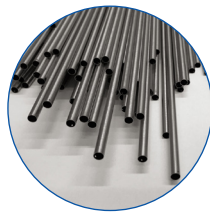
Thin Wall Tubing